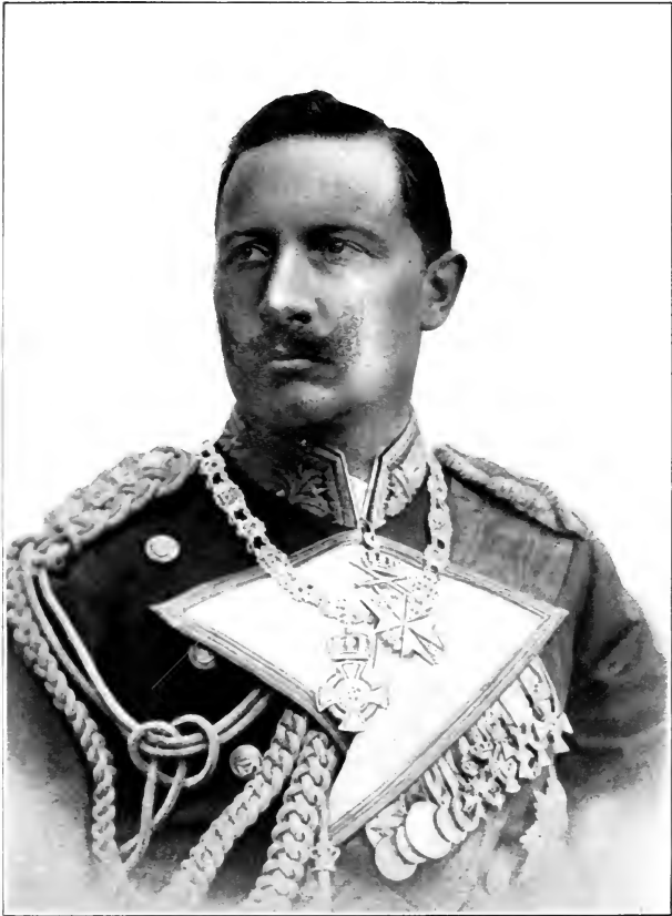
THE EMPEROR IN 1900